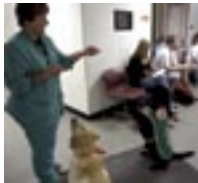
Pet Lover's Drive

MSU Veterinary Teaching Hospital. The first annual Pet Lover's Blood Drive provided an opportunity for people to donate in honor of their four-legged companions. Donors also received information on MSU's animal blood services program and left with a doggie goodie bag. Sixty pints of blood were collected.